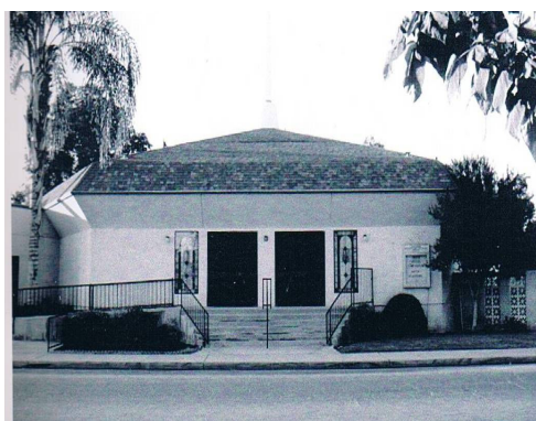
3rd & “L” Street Church